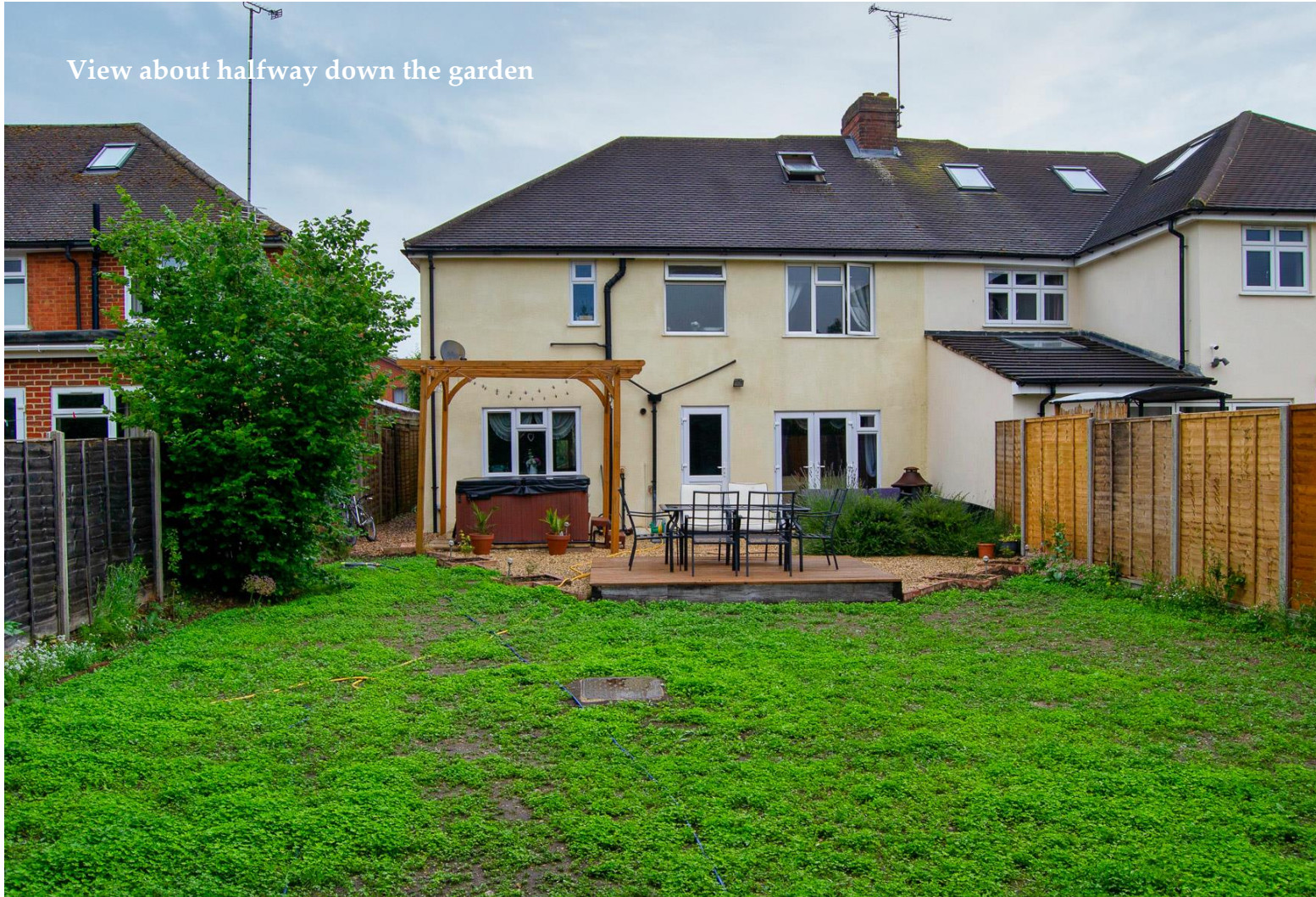
View about halfway down the garden